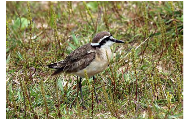
Kittlitz's Plover photographed in I Simangaliso Wetlands Park

In winter, the adults lose the distinctive face pattern and resembleKentish plovers, but they are smaller, longerlegged andlonger-billed. They have less uniform upperparts than Kentish, and always show a pink or orange breast colouration. Juvenile Kittlitz's plovers are similar to winter adults, but the underpart colour is often